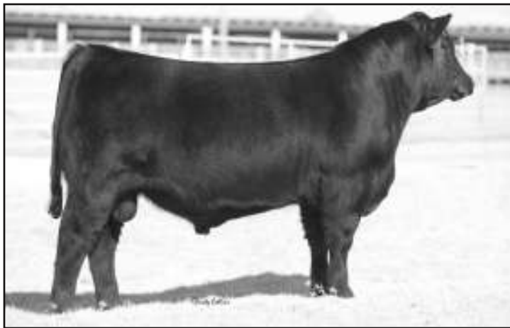
OSU Big Bucks, member of Reserve Champion Pen of Three in the 2011 Denver Stock Show.

This bull was used on some commercial heifers hence he won't be fat and sassy by any means. However, he will cover quite a few heifers and cows.