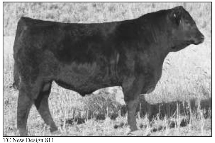
TC New Design 811