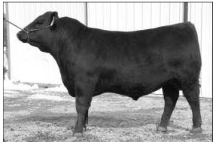
TC No Question 248.